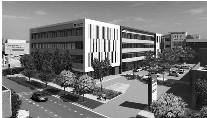
Figure 1 | Proposed Development

The project is a New Private Hospital and Medical Centre over four (4) levels with an associated multi-deck carpark over three (3) levels. Primary care is provided at Level 1, with two (2) levels of speculative tenancies at Levels 2 and 3 and a Day Hospital at Level 4.